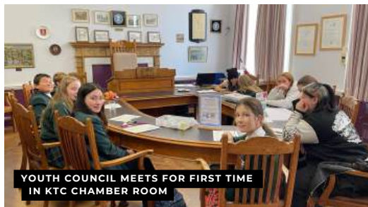
YOUTH COUNCIL MEETS FOR FIRST TIME IN KTC CHAMBER ROOM

In our TreeMendous Town display KTC hopes to demonstrate how thoughtful use of resources can help us think about how we can be kind to nature, our environment and each other this festive season.