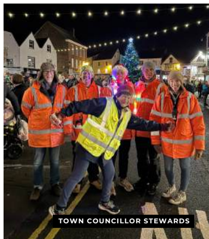
TOWN COUNCILLOR STEWARDS