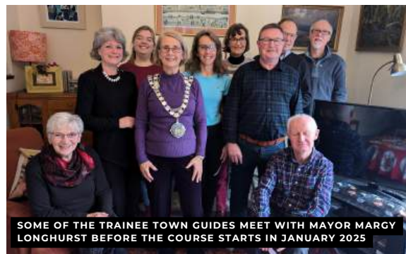
SOME OF THE TRAINEE TOWN GUIDES MEET WITH MAYOR MARGY LONGHURST BEFORE THE COURSE STARTS IN JANUARY 2025