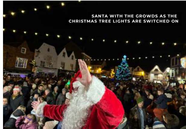
SANTA WITH THE CROWDS AS THE CHRISTMAS TREE LIGHTS ARE SWITCHED ON