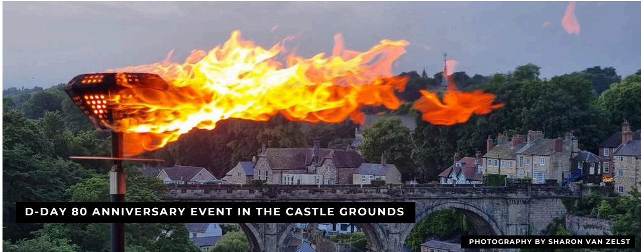
D-DAY 80 ANNIVERSARY EVENT IN THE CASTLE GROUNDS