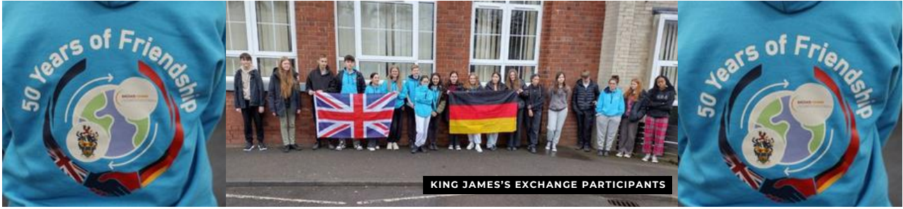
KING JAMES'S EXCHANGE PARTICIPANTS